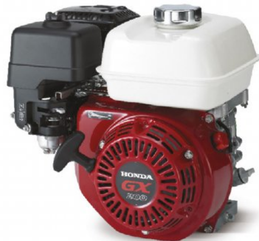
1/2 REDUCTION WITH CLUTCH (R-type)