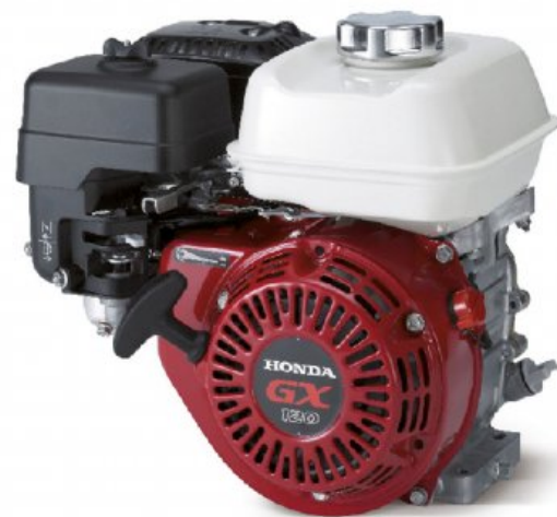
1/6 REDUCTION (H-type)