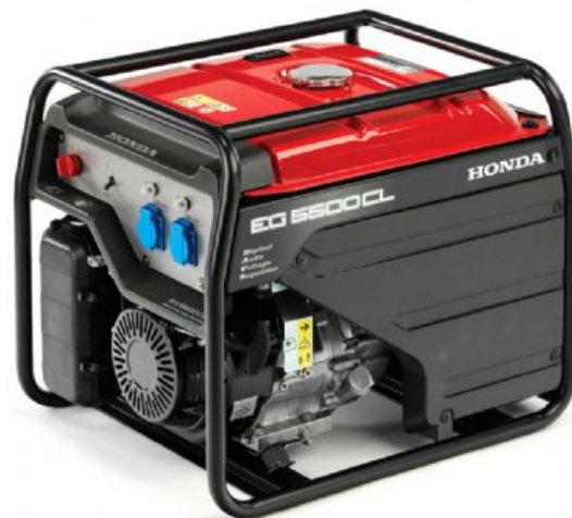
EG4500 / EG5500